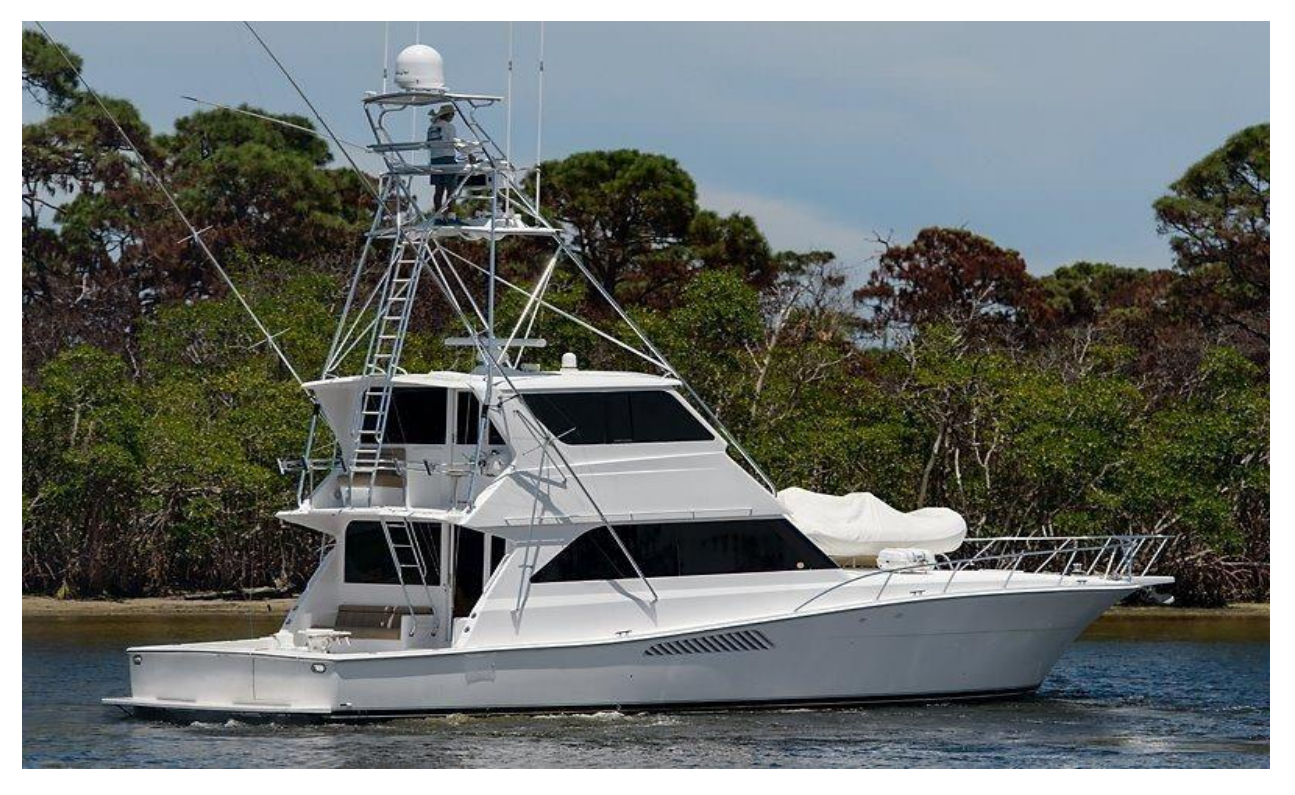
The 58' Viking 'Belleza' is the official Wet Dream Fishing Team Vessel